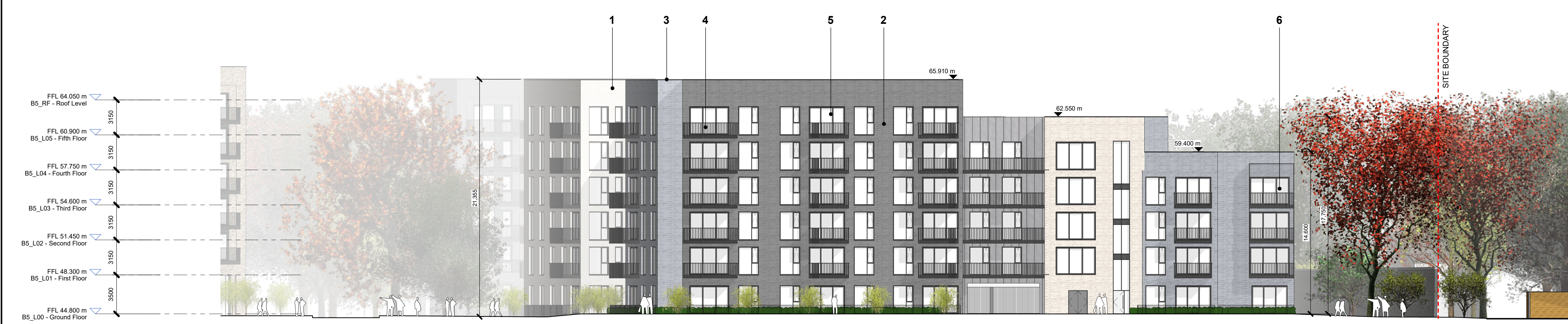
Block 05, West Elevation 1 : 200

Notes: - Do not scale from this drawing. Use figured dimensions in all cases. - Verify dimensions on site and report any discrepancies to the Architect immediately. - This drawing is to be read in conjunction with the Architect's Specification. - © This drawing is copyright and may only be reproduced with the Architect's permission.