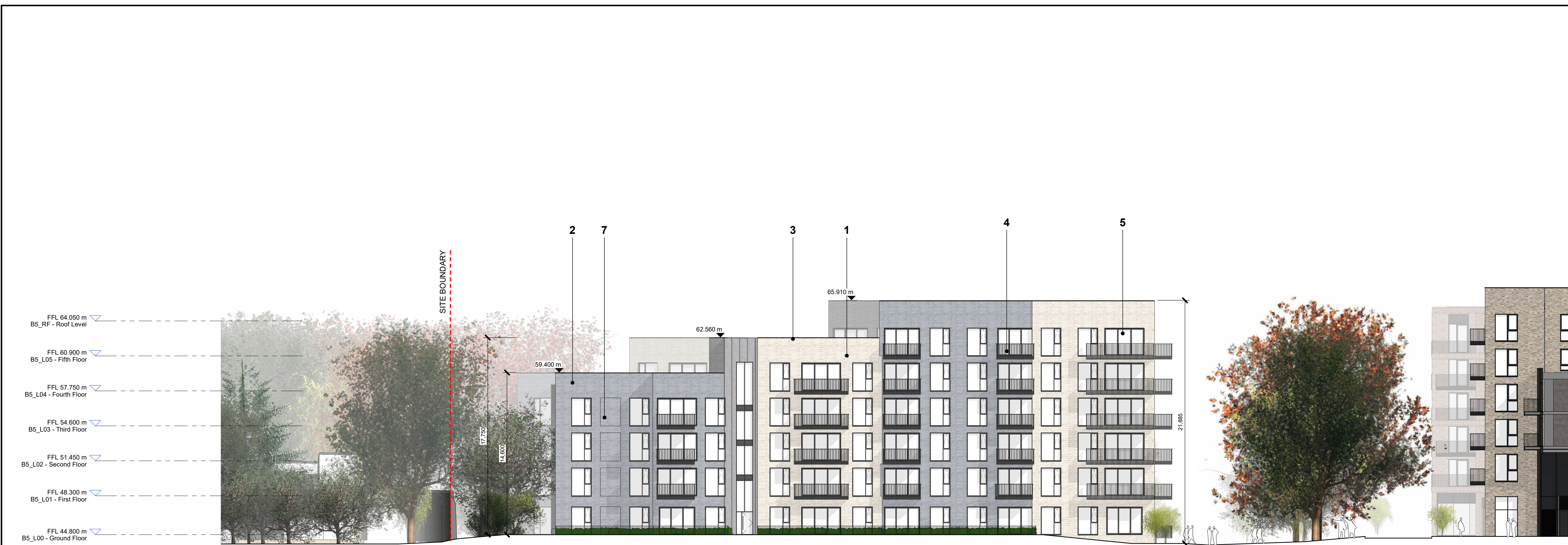
Block 05, East Elevation 1 : 200